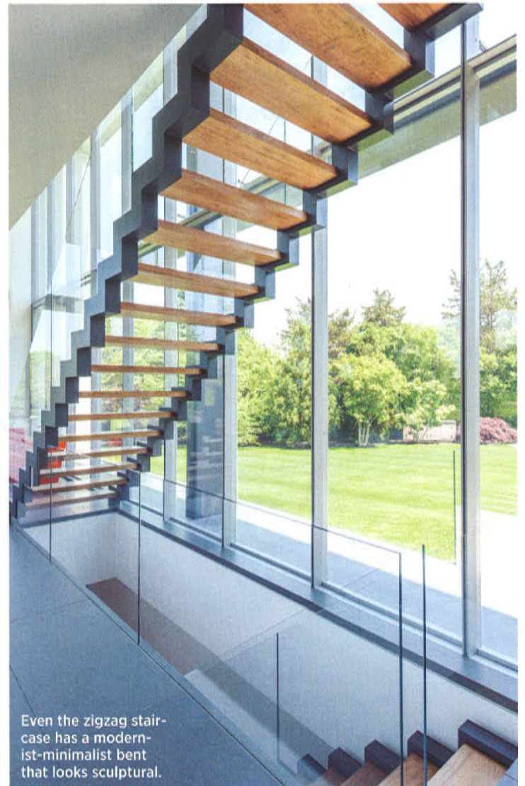
Even the zigzag staircase has a modernist-minimalist bent that looks sculptural.

What makes the house unique is the luxury of privacy. A curvy cement driveway leads up to the structure; 7 acres