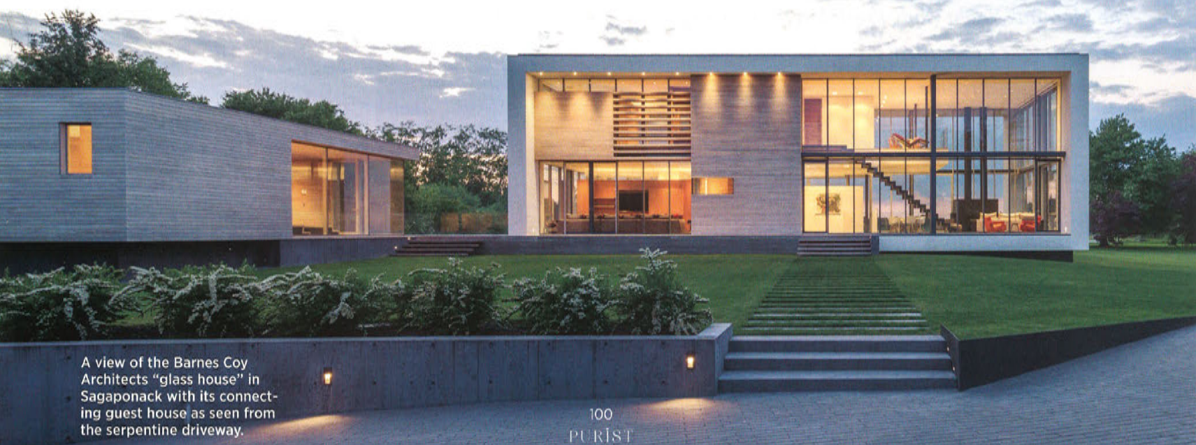
A view of the Barnes Coy Architects "glass house" in Sagaponack with its connecting guest house as seen from the serpentine driveway.