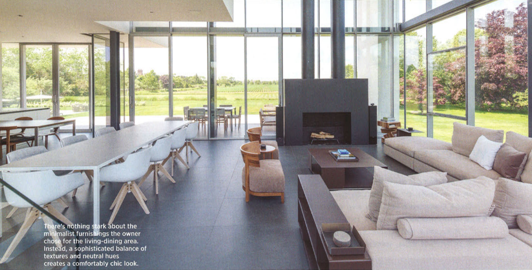
There's nothing stark about the minimalist furnishings the owner chose for the living-dining area. Instead, a sophisticated balance of textures and neutral hues creates a comfortably chic look.

one being given equal measure so they are in exquisite harmony. "No extraneous decoration and an honest use of materials," says Coy, ticking off the keys to this 8,800-square-foot, two-story home that includes a guesthouse, a lower "wellness" level with spa, sauna, steam room and plunge pool, and recreation room. While modernist designs can sometimes appear severe and cold, even unwelcoming, both the white facade and light-filled interiors feel open, airy and inviting. The sound of water contributes to the calming environment: a pristine black granite lap pool waterfalls into a whirlpool/Jacuzzi in the sunken terrace below.