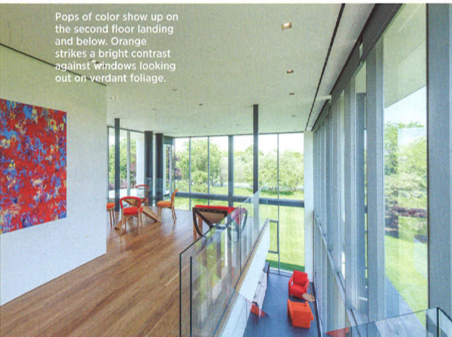
Pops of color show up on the second floor landing and below. Orange strikes a bright contrast against windows looking out on verdant foliage.