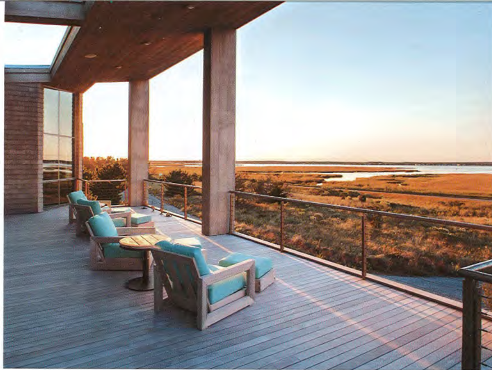
Site Specifics (THIS PICTURE) The house as seen from its ocean boardwalk. (TOP LEFT TO BOTTOM RIGHT) Peninsula chairs and ottomans from Sutherland line a deck overlooking the bay; the blue canvas fabric is from Perennials. Decorator Susan Moon covered the master bedroom's headboard in a Zimmer + Rohde fabric; the throw pillows are from Jim Thompson. The Maison de France sofa and chairs in the living room are covered in a white linen from JAB Anstoetz. Chairs from Dune, covered in a blue hide from Edelman Leather, surround an Antoine Proulx dining table. See Resources .